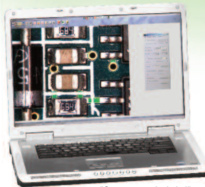
*Computer not included*