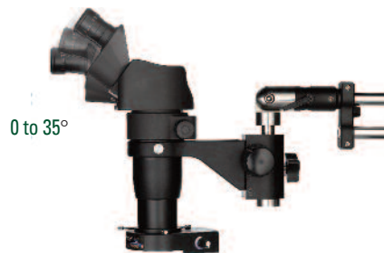
Angular Adjustment Standard on all Ergo-Zoom™ Microscopes

O.C. White exclusively offers ergonomically adjustable eyepieces standard. No one else in the world offers this, it is always an upgrade. The eyepieces are adjustable from 0 to 35° on the fly, and are useable anywhere in between. This adjustment allows for total microscope manipulation.