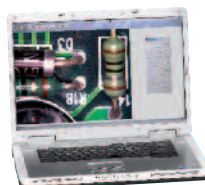
*Computer not included*

For production use, the Analog Inspection variation of our Ergo-Zoom™ microscope is among the best. We feature a superb 19" High Definition LCD monitor, as well as crystal clear 1/2" high sensitivity color analog camera. As we use only name brand components of the highest caliber, our optical performance cannot be matched.