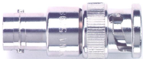
Model 5298 Triaxial 2 Lug (F) To BNC (M) Adapter